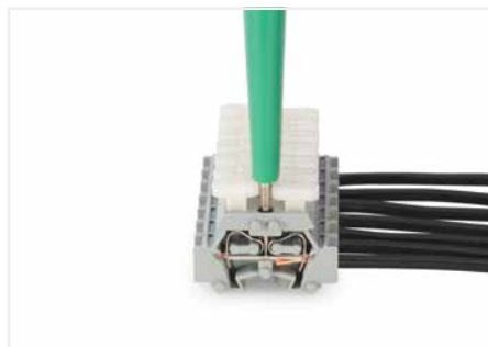
Testing with voltage tester.